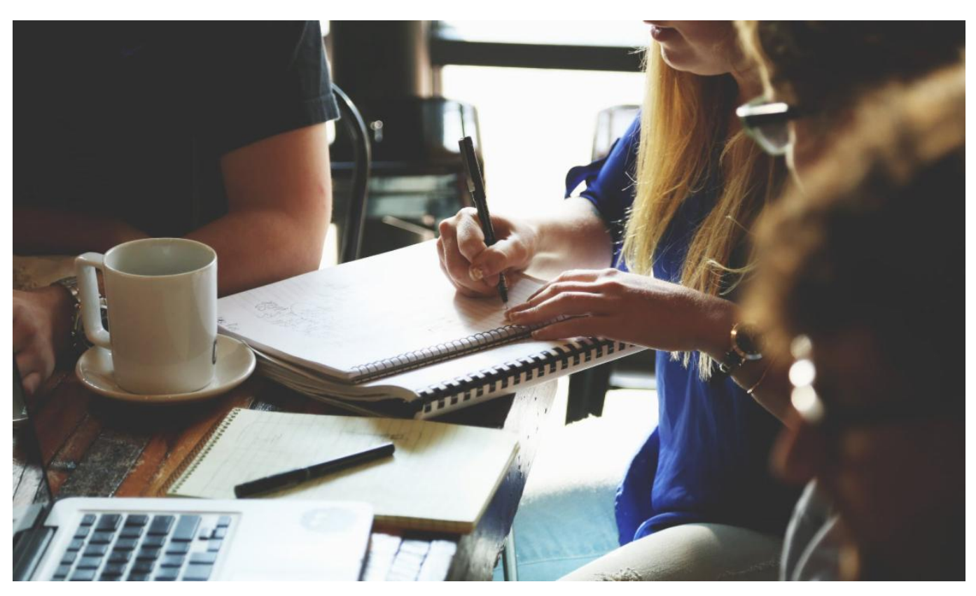
Giving Families Access to College & Transforming Lives

When is the best time to think about college? It's younger than you think and encompasses more than just saving for college. You'll want to consider standardized testing (PSATs to SATs) and overall academics. Are you (or your child)